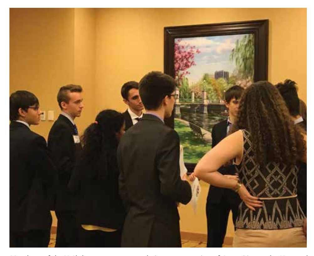
Members of the Y-Club meet to prepare their representation of Costa Rica at the Harvard Model United nations in Boston.