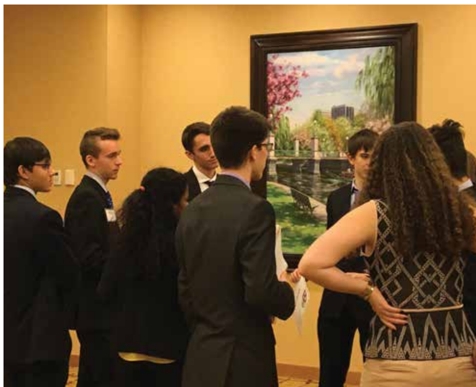
Members of the Y-Club meet to prepare their representation of Costa Rica at the Harvard Model United Nations in Boston.